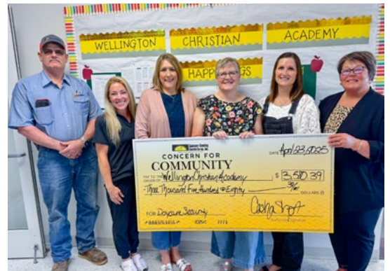
Congratulations to our 2025 Concern for Community Program recipients: Conway Springs OWLS (top left), First Christian Church (top right), Norwich Ambulance (bottom left) and Wellington Christian Academy (bottom right).

THEIR ZOLL AUTOPULSE RESUSCITATION SYSTEM. This system improves positive patient outcomes by delivering uninterrupted compressions during cardiac arrest emergencies and is especially vital during transport or in confined environments.